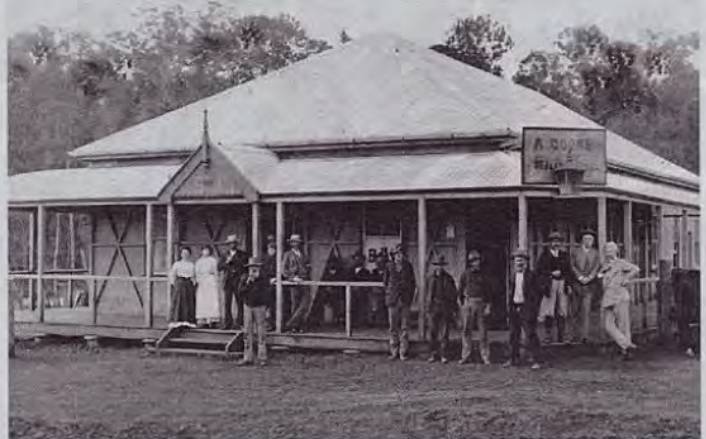
Above: Maleny Hotel 1910

"If he hadn't taken over the hotel they would have lost their license. He also built the cattle saleyards which were